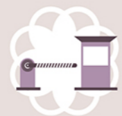
Gated & Guarded