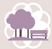
Landscaped Linear Park