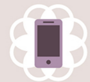
Bukit Puchong App

As a resident, you'll enjoy complete peace of mind knowing your family and home are safe - through the Bukit Puchong community app.